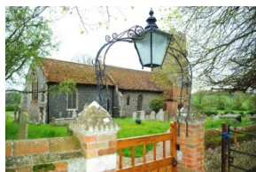
St Mary's Great Bealings -

St Mary's, Woodbridge and St Mary's, Great Bealings will be open from 11.00 am until 3.00 pm.