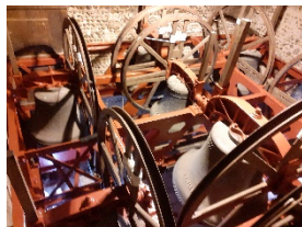
Bells will peal