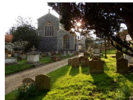
Spring is coming

OBJECTIVE: to personalise our commemoration of the setting up of the new Benefice by visiting both churches, pause for prayer and contemplation, and signing a commemorative book in each.